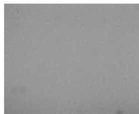
Flat field from SBIG Even-Illumination Shutter