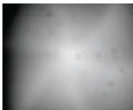
Flat field from iris/leaf shutter